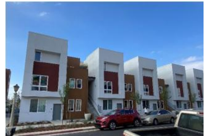
AHSC Round 4 awardee. Mission Heritage Plaza in Riverside, CA.