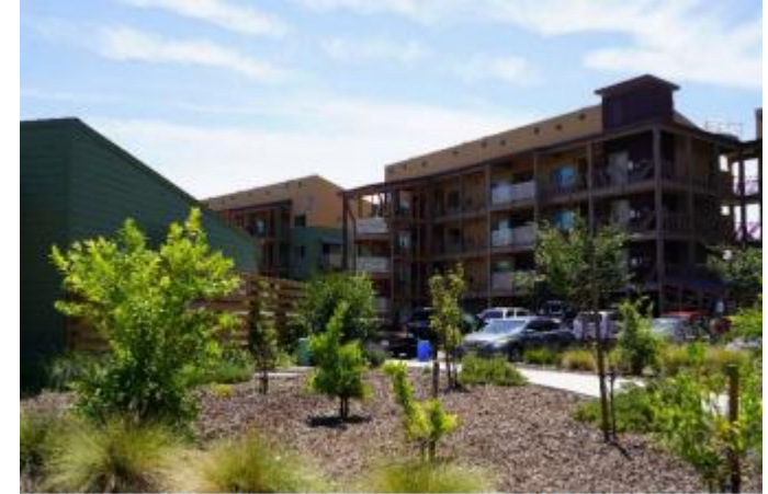
AHSC Round 2 awardee. Creekside Apartments in Davis, CA.