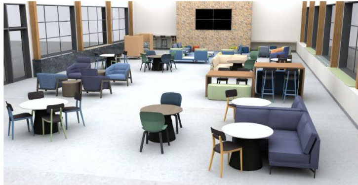
RENDERINGS | MAIN LOBBY VIEWS