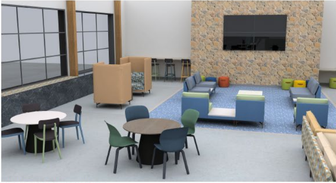
RENDERINGS | MAIN LOBBY VIEWS